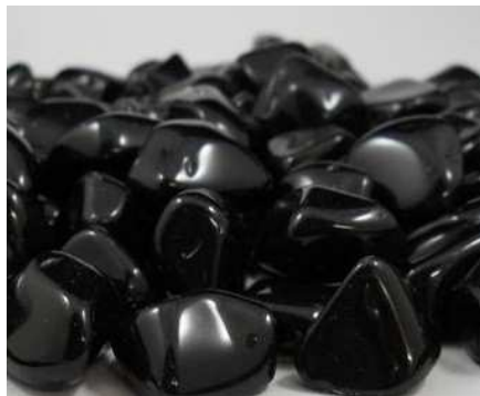
Apache Tear Drops

The stones are said to bring good luck to those possessing them. It is said that whoever owns an Apache Tear Drop will never have to cry again, for the Apache Women have shed their tears in place of yours.