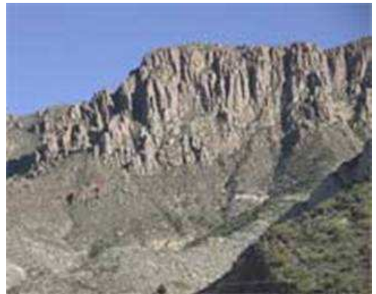
Apache Leap-Big Picacho Mountain

For years afterward those who ventured up the treacherous face of Big Picacho in Arizona found skeletons, or could see the bleached bones wedged in the crevices of the side of the cliff.