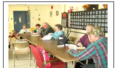
Members enjoying the program.